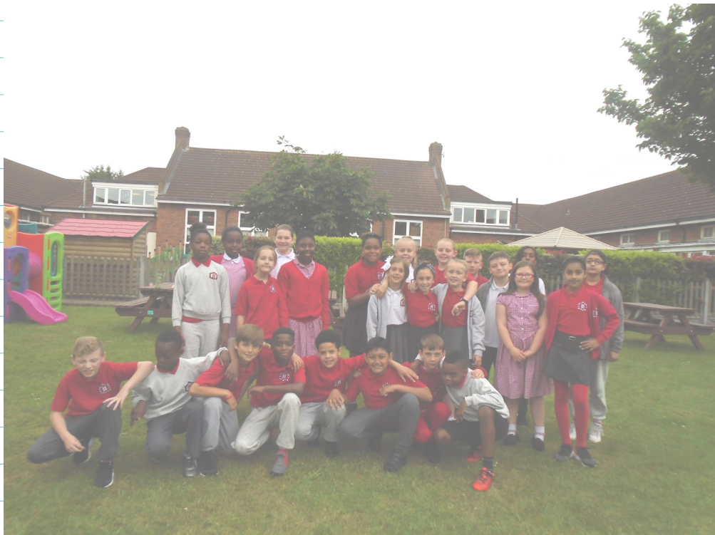
Hunters Hall Primary School Play Leaders