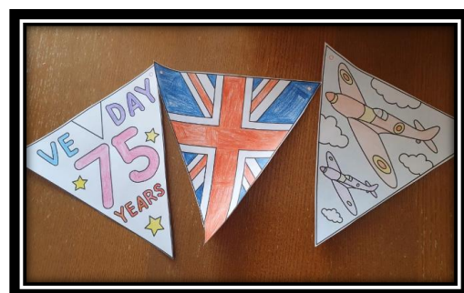
Amana 3G made this colourful bunting.