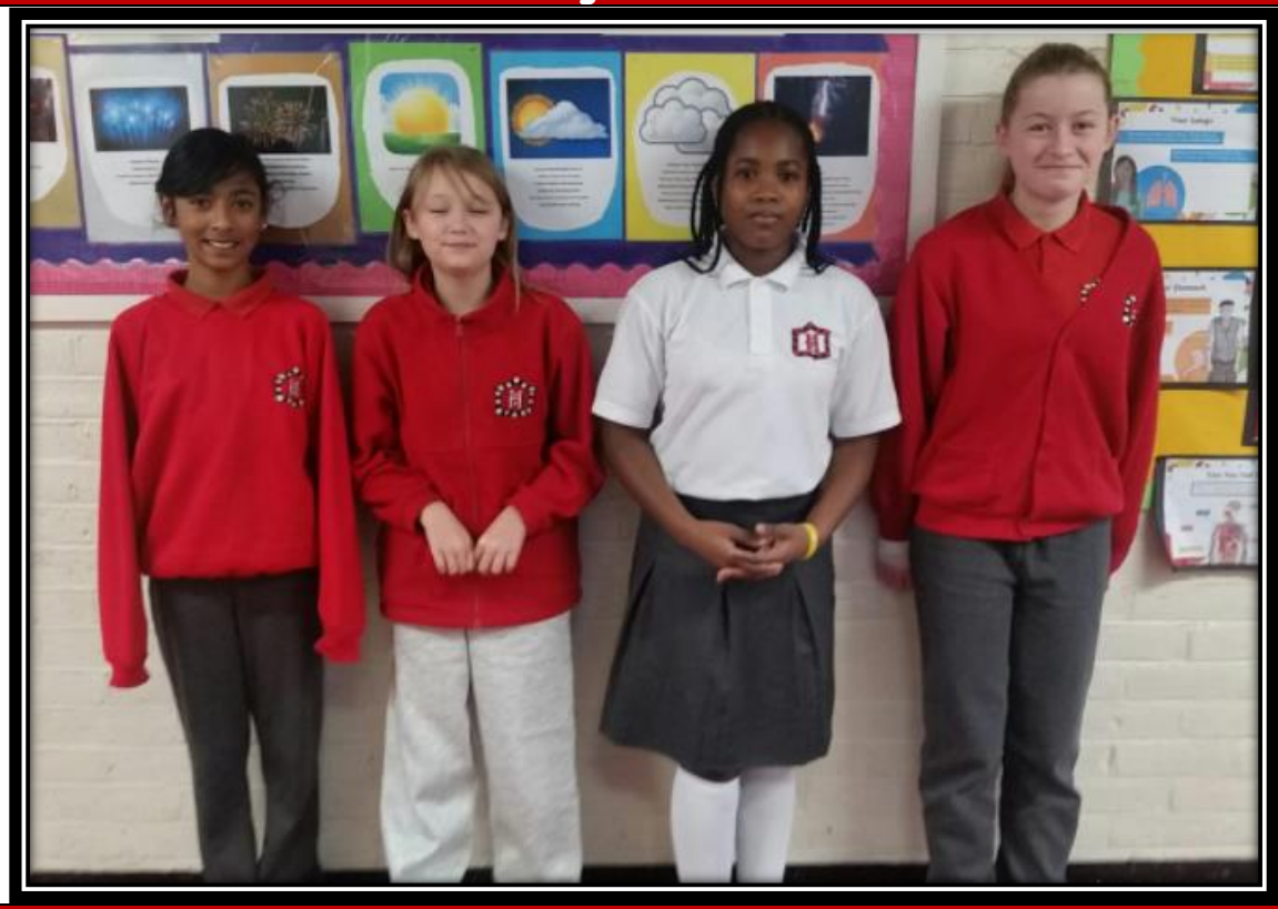
Well done to the recipients of the end of term certificates.