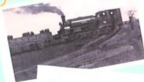
BARRY THE BECONTREE ESTATE TRAIN ENGINE IN THE 1920S