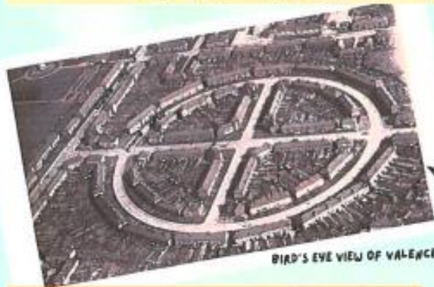
BIRD'S EYE VIEW OF VALENCE CIRCUS