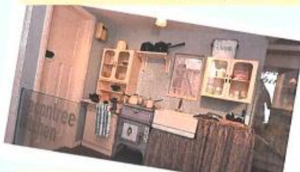
A BECONTREE KITCHEN ON DISPLAY IN VALENCE HOUSE MUSEUM

PRIVET HEDGES WERE PLANTED AT THE FRONT OF EACH GARDEN AND PEOPLE SPENT LOTS OF TIME KEEPING THEM NEATLY TRIMMED. GARDENING WAS VERY POPULAR AND THERE WERE COMPETITIONS FOR THE BEST-KEPT GARDENS AND FOR GROWING FLOWERS, FRUIT AND VEGETABLES. WINNERS RECEIVED SPECIAL TROPHIES THAT THEY WERE VERY PROUD TO SHOW OFF.