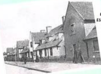
BECONTREE ESTATE HOUSES IN 1932

IN 1921 LONDON COUNTY COUNCIL STARTED AN ENORMOUS HOUSE BUILDING PROJECT. THEY WANTED TO BUILD FAMILY HOMES WHERE PEOPLE COULD LIVE HAPPY AND HEALTHY LIVES AFTER THE END OF THE FIRST WORLD WAR A FEW YEARS EARLIER.