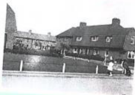
BANJO STREET LAYOUT IN 1932

MANY HOUSES ALSO HAD A SHARED PORCH AND SHARED STEP BETWEEN NEXT DOOR NEIGHBOURS. THIS WAS A GREAT CHANCE TO GET TO KNOW THE NEIGHBOURS AND MAKE FRIENDS.