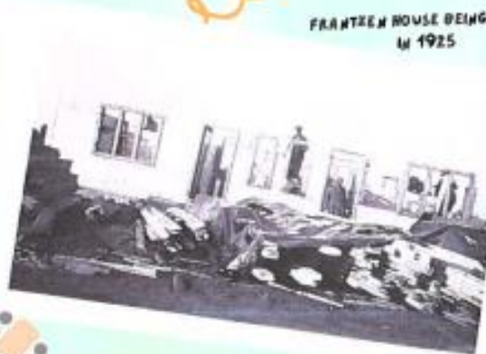
FRANKEN HOUSE BEING BUILT IN 1925

TRAINS MOVED THESE MATERIALS AROUND THE ESTATE ON SPECIAL RAIL LINES THAT WERE PUT IN TO MAKE THE JOB QUICKER. THIS IS WHY SOME ROADS IN DAGENHAM ARE VERY WIDE.